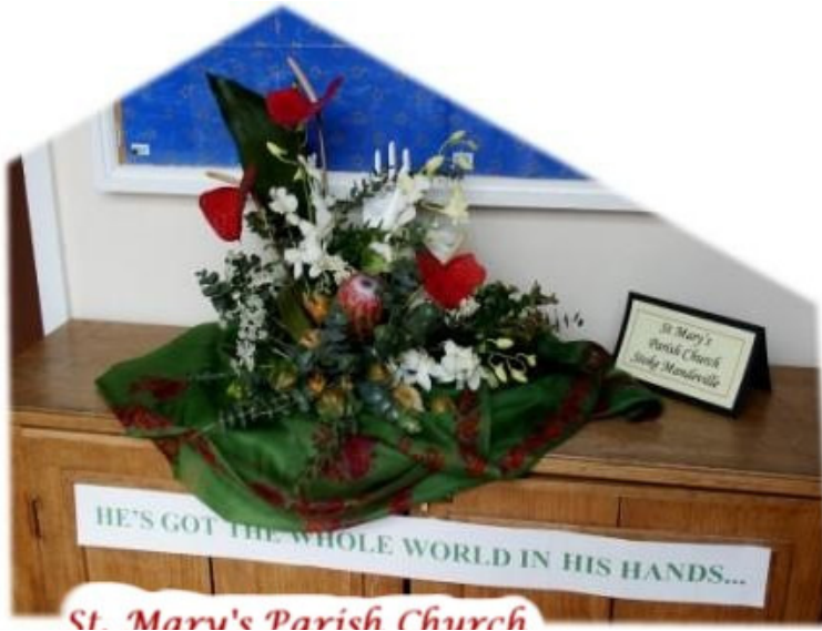
St. Mary's Parish Church

visitors to the Chapel on the Saturday and Sunday were greeted in the entrance lobby by an arrangement from St. Mary's Parish Church illustrating 'He's got the whole world in His hand '