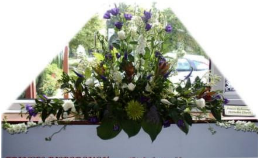
PRINCES RISBOROUGH Think of a world without any flowers

The arrangement from Princes Risborough on the theme of the modern hymn 'Think of a world without any flowers'