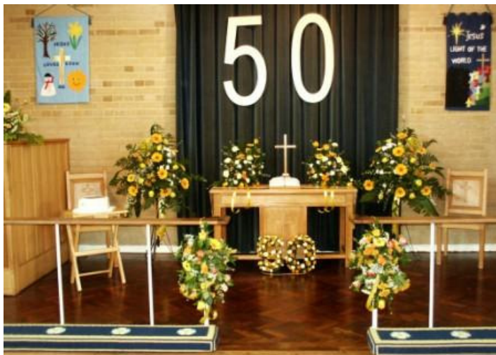
Arrangements by the Stoke Mandeville team reflecting this Golden Anniversary

It was great to see a full church with people from all parts of the Circuit and St. Mary's Parish Church, that optimism is certainly fuelled by the demonstration of support from the Circuit for which we thank all who worked so tirelessly and expertly to make this weekend so memorable.