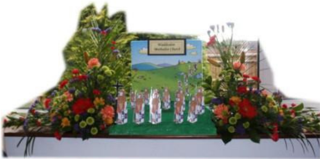
WADDESDON Onward Christian soldiers.

The far centre window ledge was filled with the waddesdon display on the theme of ' Onward christian soldiers '