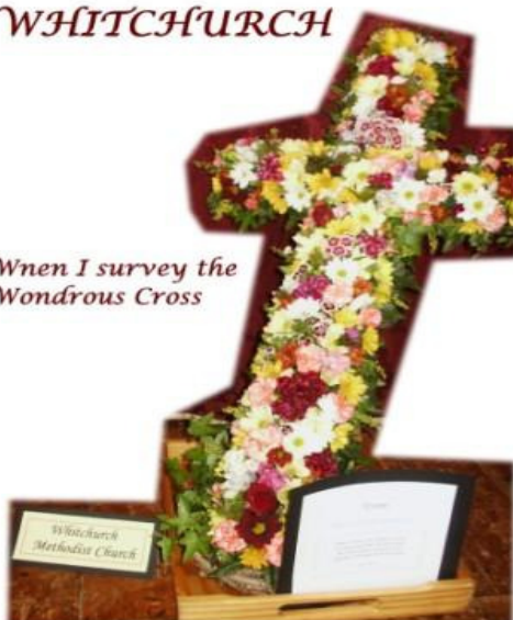
Whitchurch Methodist Church

Next was the contribution from Whitchurch on the theme of 'when I survey the Wondrous Cross '