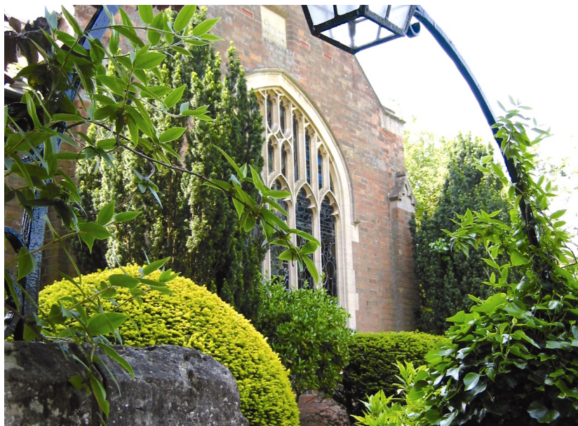
Weedon Chapel Window— see page 8 for cover story