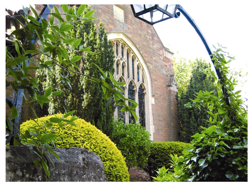
Weedon Chapel Window— see page 8 for cover story