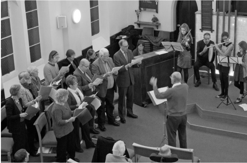
Christchurch Choir in action - Cover story page 4